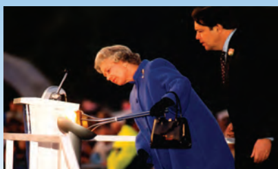
Queen Elizabeth II lights a beacon to celebrate the 50th Anniversary of VE Day.