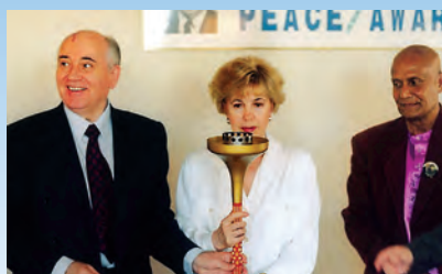
Former Soviet President Mikhail Gorbachev holds the torch with Raisa Maximovna as Sri Chinmoy looks on.