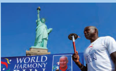
Nine-time Olympic gold medalist Carl Lewis lights the torch at the Statue of Liberty.