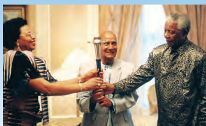
Nelson Mandela, former President of South Africa, and his wife Mama Graça Machel, with Sri Chinmoy.