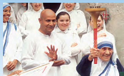
Mother Teresa and Sri Chinmoy celebrate the spirit of harmony.