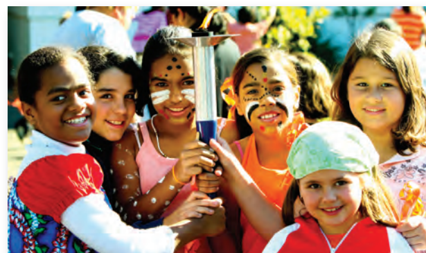
Children – Tomorrow's World Leaders: The World Harmony Run brings the message of peace and friendship to students in thousands of schools around the world.