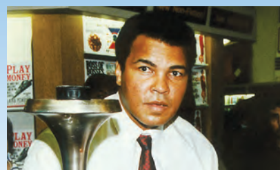
Muhammad Ali , world renowned boxing great, reflects on harmony.