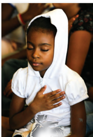
Making a wish for world peace.

Along the route people in thousands of communities — from children to senior citizens, from everyday folks to world leaders — will join the World Harmony Runners by running with the torch, all of us adding our hopes and dreams in a global wave of friendship and goodwill. Through direct participation and media coverage, the World Harmony Run will touch the lives of millions.