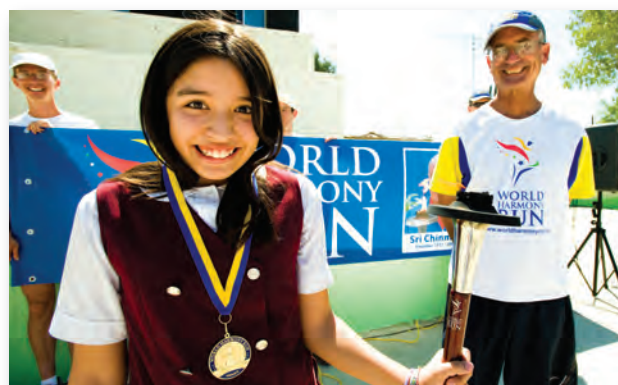
You and your community are invited to nominate recipients for the Torch-Bearer Award. This girl was chosen by her classmates.

The World Harmony Run offers its Torch-Bearer Award to recognize and honor those who have made significant contributions of service to their community -- whether they are Presidents or schoolchildren.