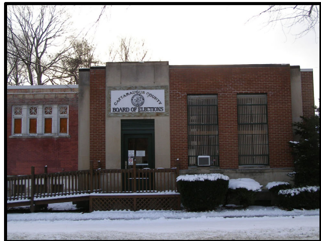
Front entrance to the Board of Elections. (an addition to the right side of the Museum)