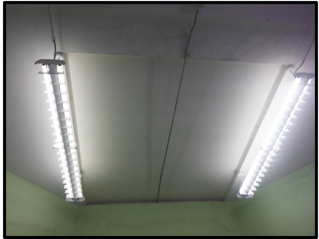
Original dome was removed after water leaked into the building and caused major damage.