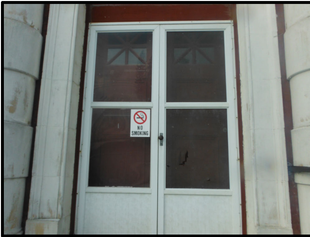
Front doors are too narrow to meet Americans with Disabilities Act standards.