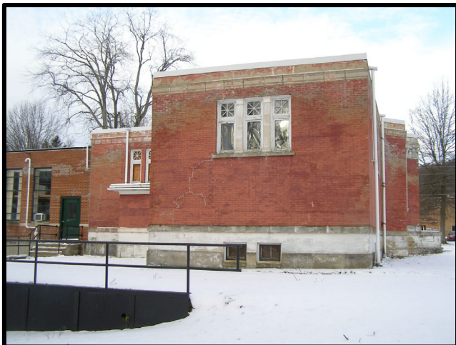
Back side of the joined buildings: Board of Elections (left) and Museum (right).