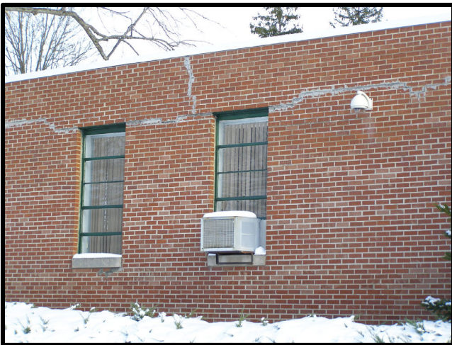
Large crack on the right side of the Board of Elections.