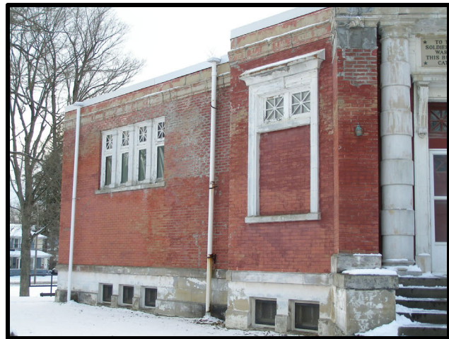
Left side of Museum.