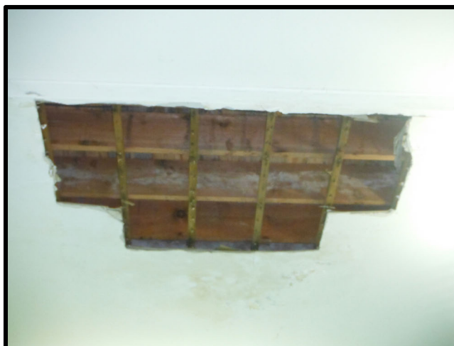
Internal ceiling damage from poor roof conditions (pitch and tar roof).