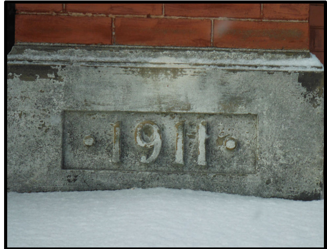
Key elements of the building: Dedication Plaque and Cornerstone will be saved.