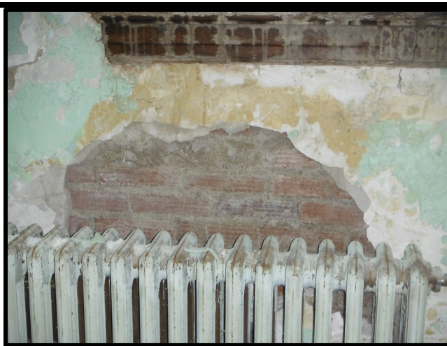
Water infiltration seeping through walls due to the breakdown of brick pointing, and poor roof conditions. This not only caused internal damage but mold as well.