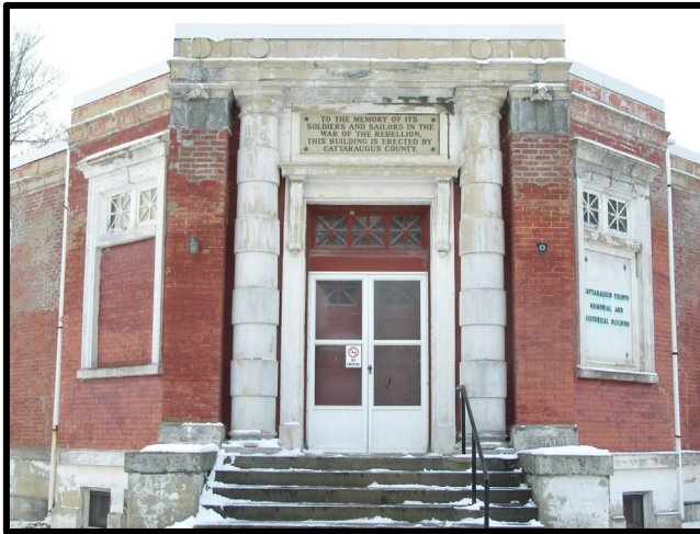
Front of the Museum.