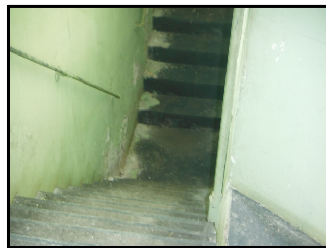
Field bricks allow water to seep into foundation which weakens structure and causes mold. Stairwell too steep and does not meet current codes or ADA compliance standards.