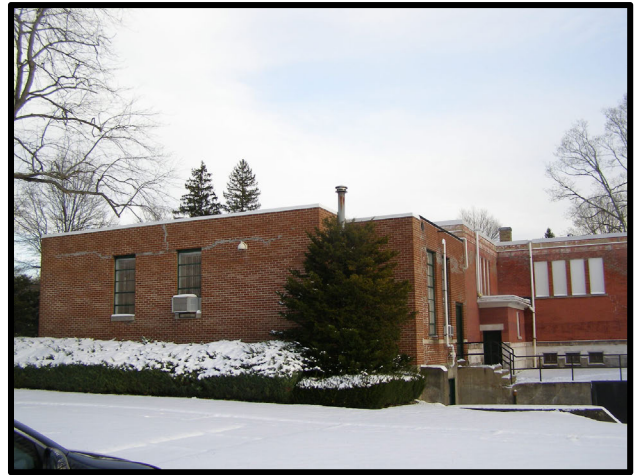
Right side of the Board of Elections.